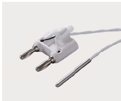
E2308A Thermistor Probe