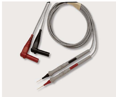
34133A Precision Electronics Test Leads