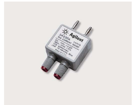
34330A 30A Current Shunt