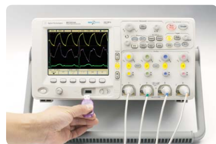
Figure 2. To permanently store data, you can save it to an external USB memory device through the oscilloscope's front panel USB port.