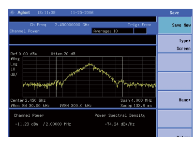
Figure 1 Channel power measurement