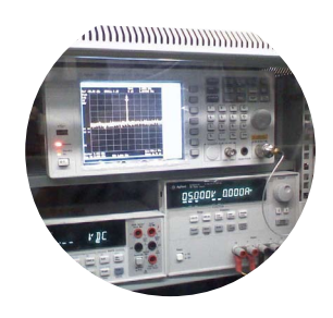
Figure 4 Testing system – N9320B RF spectrum analyzer, E3632A power supply and 34401A digital multimeter